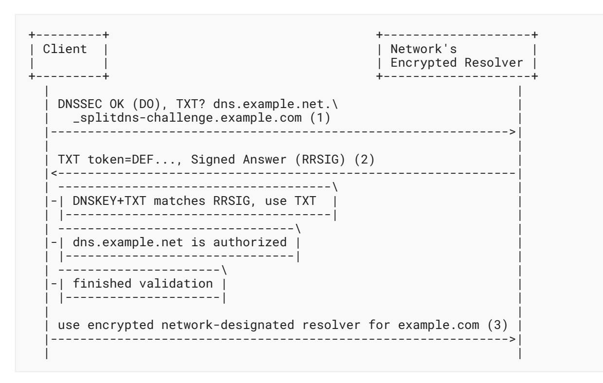
Figure 4: An Example of Verifying Claims Using DNSSEC